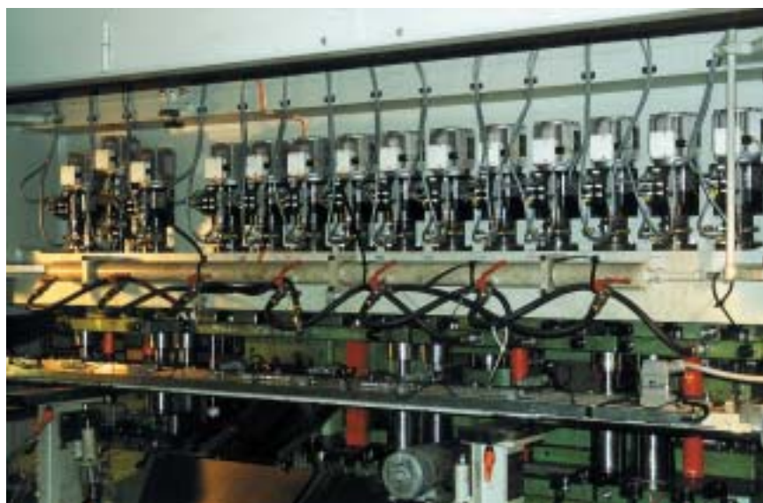
Electromechanical swivel and pull clamping elements mounted on a transfer press.