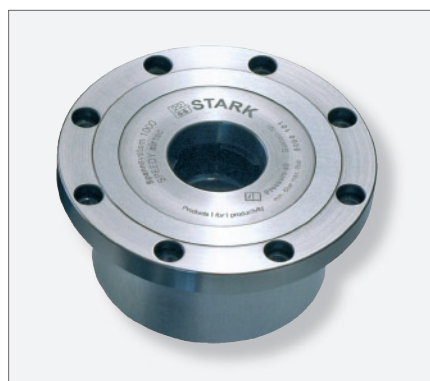
SPEEDY airtec , size Ø 105 mm