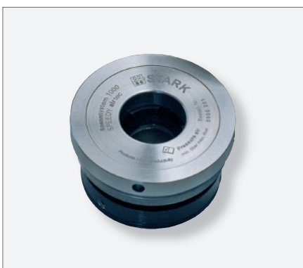
SPEEDY airtec , size Ø 80 mm