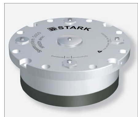
SPEEDY airtec , size Ø 155 mm, with central locking, mounts and index bores