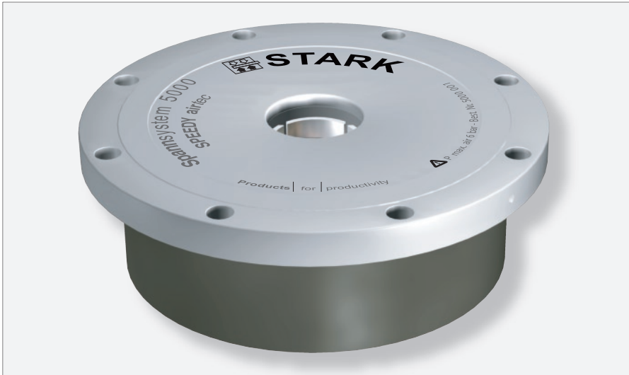
SPEEDY airtec - locks mechanically, releases pneumatically